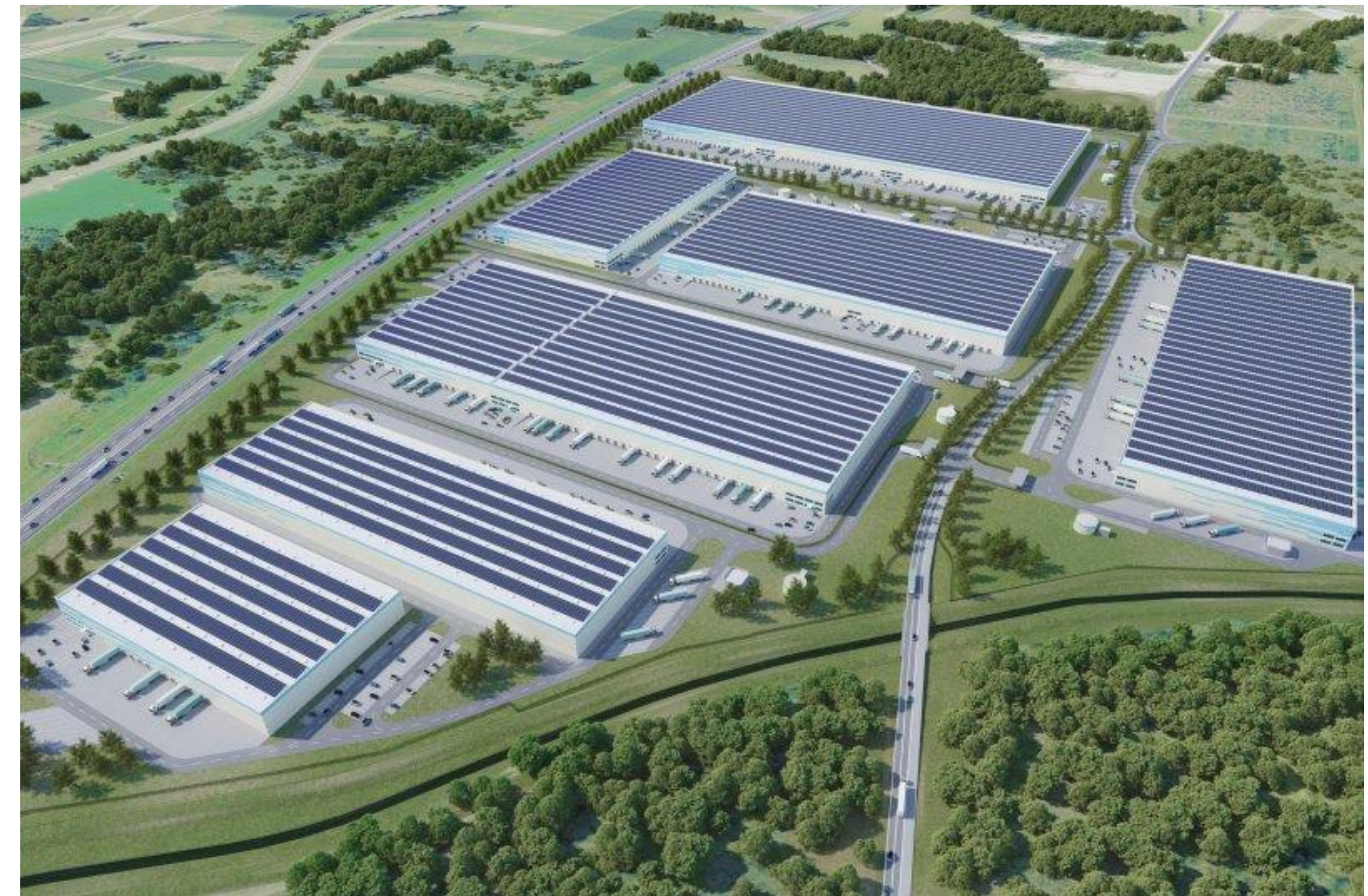
Visualization of the Park Zagreb North

A new bus stop is located right in the middle of the park.